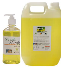
Fresh Hands ELQ (Yellow Clear Gel - Economy)