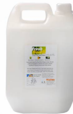
Fresh Hands Pearl (Opaque Pearly White - Luxury)