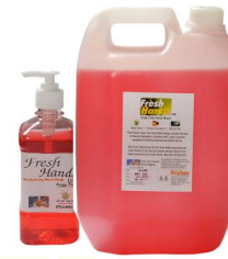
Fresh Hands LQ (Pink Clear Gel - Premium)