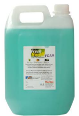
Fresh Hands Foam (Blue Clear Gel - For Foam Dispenser)